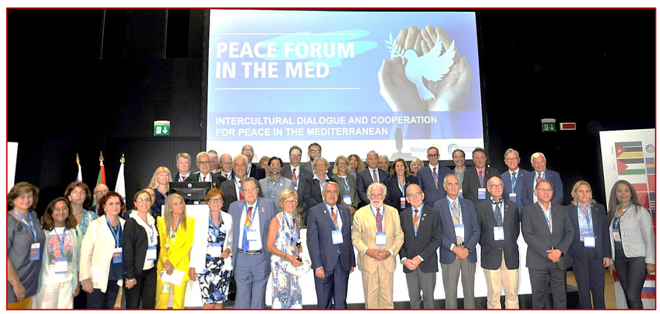
Conclusion of the Forum. Group photo with some of the participants.

The ancient Romans said: "If you want Peace, prepare for War" but today we all say together: "If you really want Peace, prepare Peace"