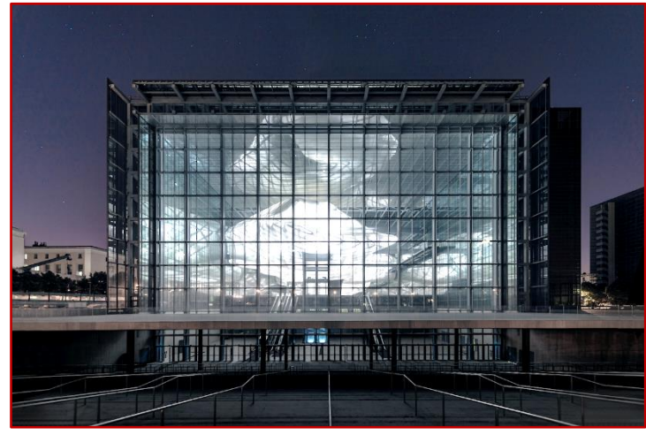
"La Nuvola" Congress Center, Rome

Subject: "Intercultural dialogue and cooperation for peace in the Mediterranean"