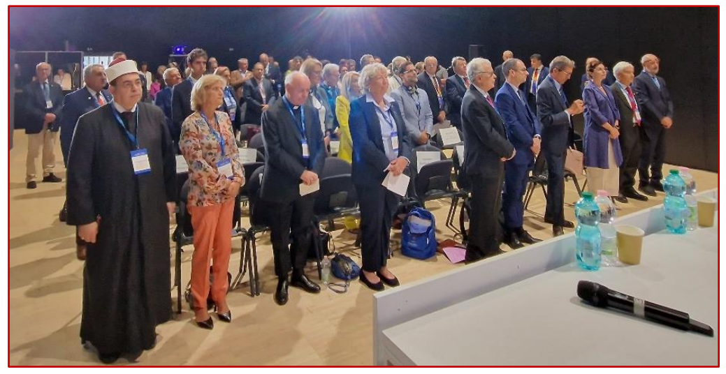
Participants during the "Honors to the Flags"